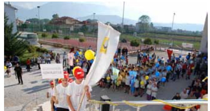
2007-2008 First class of NEHEMIA High school graduates. Beginning of "adidas-NEHEMIA Challenge Cup".