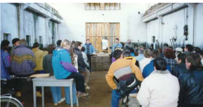
1997 Internal riots in Albania caused the destruction of many projects of NEHEMIA.