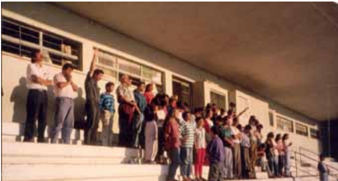
1991 First trip to Albania.