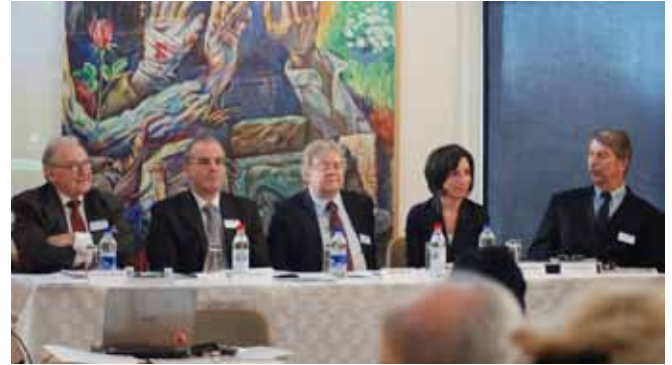
2005-2006 Opening of Local Center Has. First steps for the foundation of Nehemiah Gateway University.