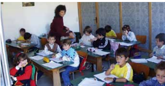
1998 Inauguration of NEHEMIA School and Center in Pogradec. Opening of "The Class of Hope" (now Amaro Tan School) for the Roma community children.