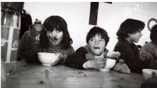
1992-1996 The opening of the "Soup kitchen" for the poor, and other supporting projects.