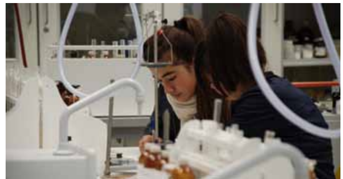
2009- 2010 Inauguration of high school NEHEMIA building in Buçimas