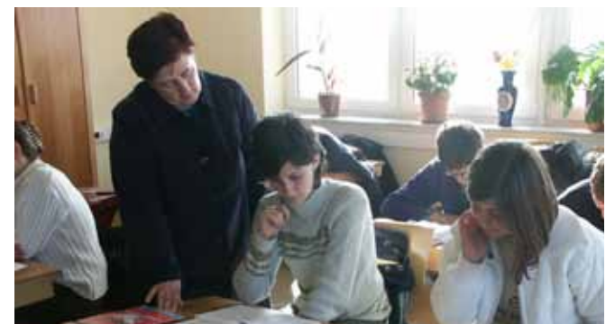
2003-2004 Inauguration of three buildings in Buçimas: Church, School, and Mission House. The first year of NEHEMIA high school starts.