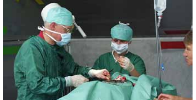
1999 About 4000 Kosovo people found shelter and care for several months at NEHEMIA Center in Pogradec.